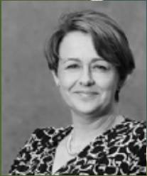
Baroness Tanni Grey-Thompson Dbe, DI